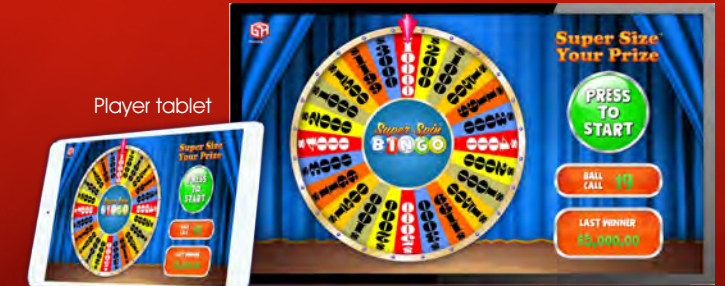
Displays throughout your bingo room

Super Spin Bingo™ is adaptable to any bingo pattern. Interactive fun and excitement for the entire bingo room.