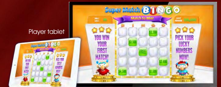
Displays throughout your bingo room

Super Match Bingo™ is a fun new way for players to win. Players pick their lucky numbers until they have a winning match.