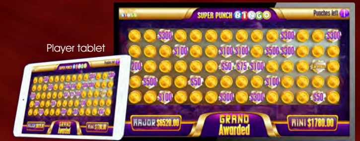
Displays throughout your bingo room

Super Punch Bingo™ is an electrifying bingo adventure. Play now and punch your way to incredible prizes!