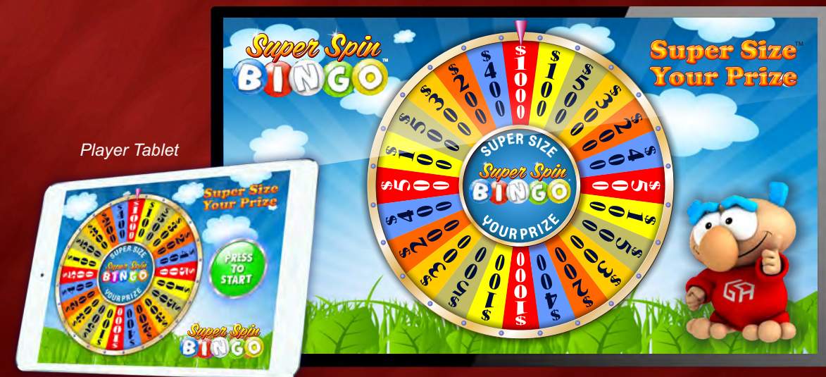
Displays throughout your bingo room and property

While the winning player spins, your entire room shares in the thrill and excitement on displays throughout your bingo room! And for those big games to drive big play, Gaming Arts can insure any prize up to $1,000,000!