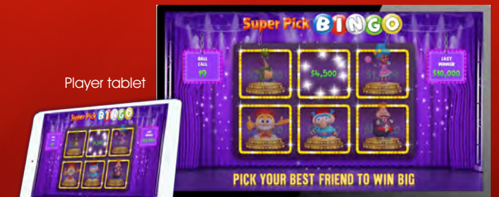
Displays throughout your bingo room

Super Pick & Win Bingo™ includes six adorable animated characters. Players pick their favorite to win great prizes.